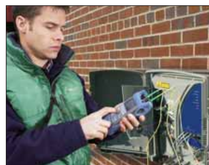
The PPM-352B used at the ONT.