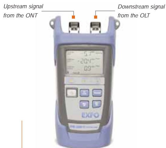
The PPM-350B-EG two-port power meter.

The industry's first PON-specific power meter, the PPM-350B is the flagship of EXFO's line of test instruments specifically intended for FTTH and FTTP systems. Available in four models, the PPM-351B, PPM-352B, PPM-352B-EG and PPM-352B-EG-ER, it is the ideal tool for FTTH/FTTP service activation and troubleshooting.