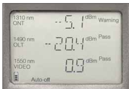
The PPM-350B's display.