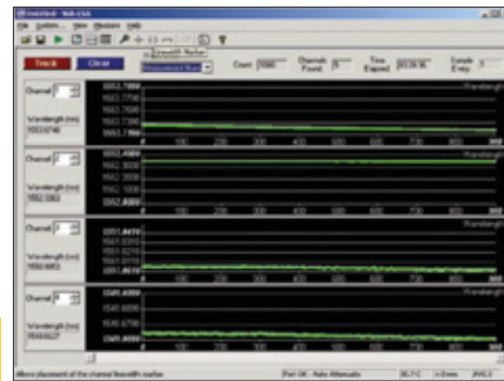
Trend analysis measures changes in wavelength over time.

To enable more detailed analysis, data collection by the WA-650 can be paused at any time to hold the most recently displayed spectrum. Or, the spectral data can be saved for future analysis. What's more, trends in laser spectral performance, such as frequency drift, can be analyzed over time with a real-time plot.