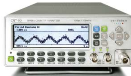
Figure 5: Display showing the trend (signal over time) of sampled data.