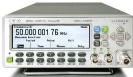
Figure 2: Measure function selection menu, shown with measured results.