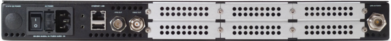
Base units include 10 MHz and 1PPS output signals, network port, and choice of power, GPS reference, and internal oscillator options.