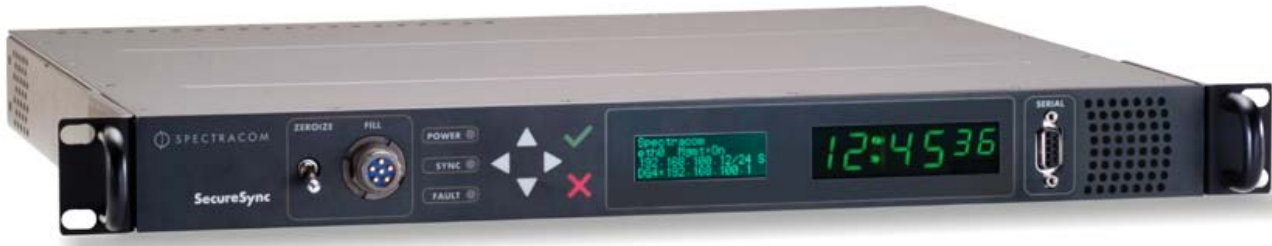
Shown with secure GPS (SAASM) option.