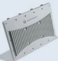
AP-5181 Dual Radio AP AP-5181-13040-WWR