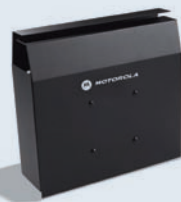
Heavy Weather Kit KT-5181-HW-01R