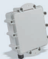
48V Transformer and Power Surge Protector AP-PSBIAS-5181-01R

Not Shown: Wall Pole and Mounting Kit (KT-5181-WP-01R) and Outdoor Antennas